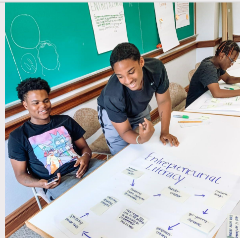
Learn & Earn Recruitment